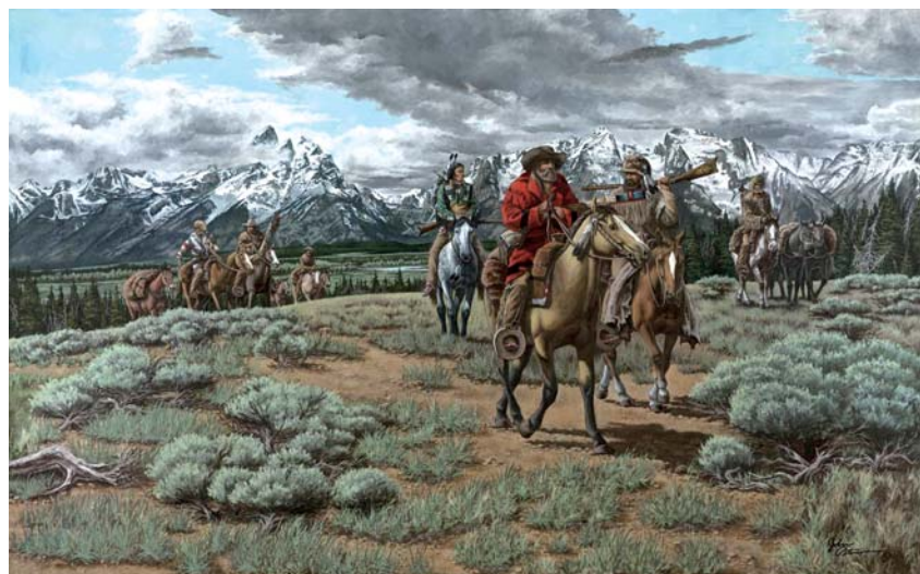
Heading for the Yellowstone , oil, 30 x 48"