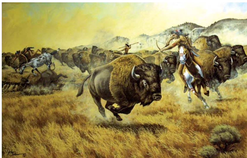
Perilous Hunt , oil, 24 x 40"