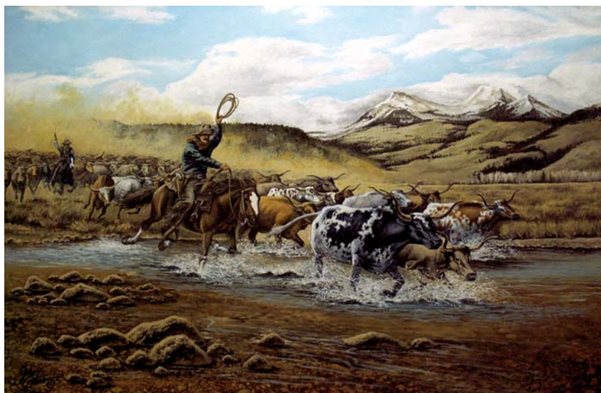
Longhorn Stampede , oil, 24 x 36"